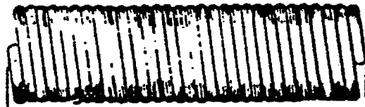
Length in inches of 20 coils

To determine if a spring is a "right" wound or a "left" wound, hold the spring horizontally and compare with the picture above. Also, if the spring is similar to a right thread bolt, the spring is a right hand wound spring, and vice versa.